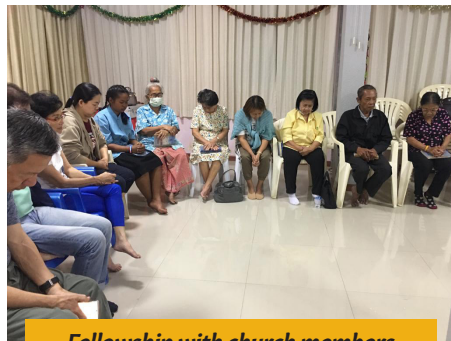
Fellowship with church members

We left for Bangkok the following morning to catch our flight home – feeling tired but richly blessed!