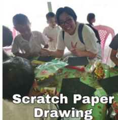
Scratch Paper Drawing