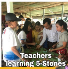
Teachers learning 5-Stones