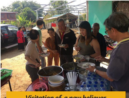
Visitation of a new believer