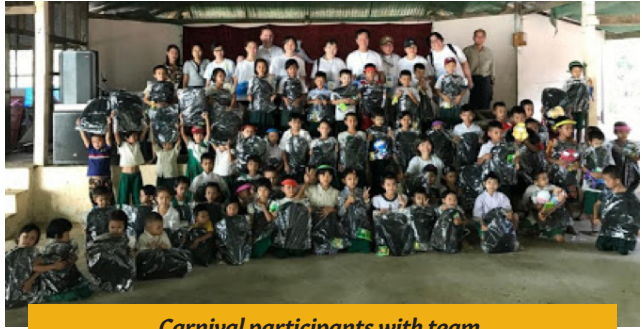
Carnival participants with team.

I found a shop that sold it at a more special price and I bought all that the shop had for that day. That was the exact number of boxes I needed! There was no more special price boxes after that.