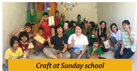
Craft at Sunday school