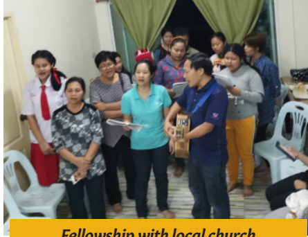
Fellowship with local church

extremely respectful towards us when we were there, which shows how the Thai culture teaches them good values like discipline and respecting their elders.